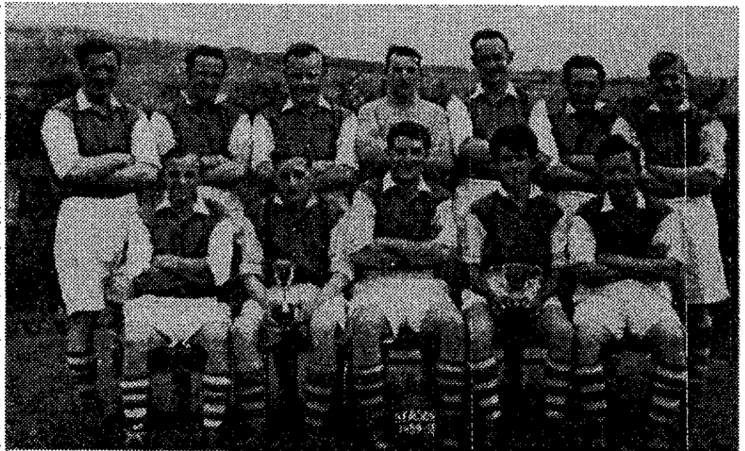
HAYDON BRIDGE F.C. TEAM OF 1954/55

In the 50s, the team was well supported, on several occasions playing in front of cup final crowds in excess of 1,000. And in the seasons of 51-52, 53-54, and 54-55, finishing Champions. The 54-55 campaign saw them win the table with a record 9 points ahead of the team in 2nd place. Which was equalled, by a later Haydon Bridge