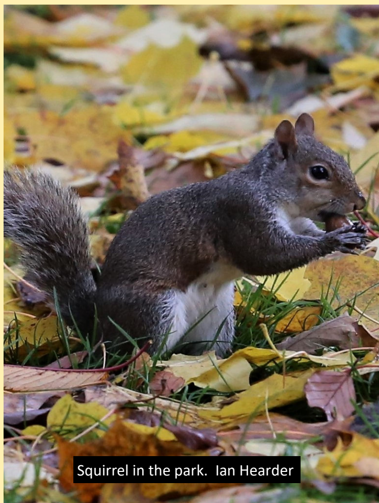
Squirrel in the park. Ian Header

19.30 - Shaftoe Singers @ Methodist Chapel