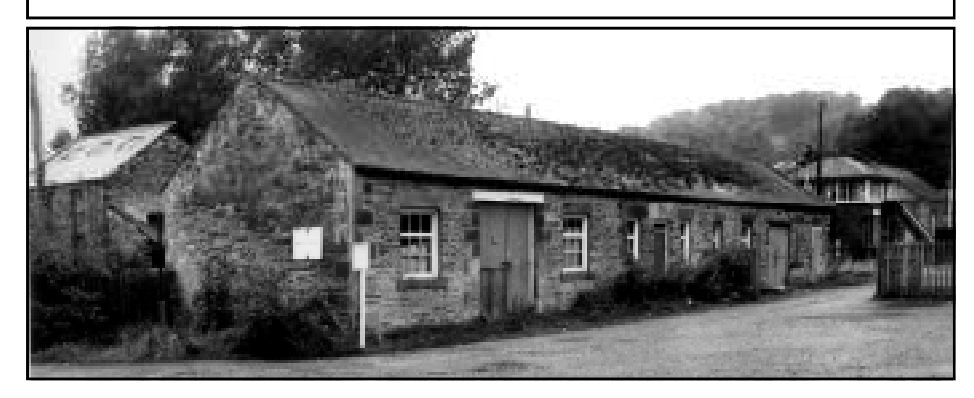
Our photograph shows the library building as it is remembered by William Veitch

The large gates leading to the station yard from Church Street were regularly closed and locked in those days.