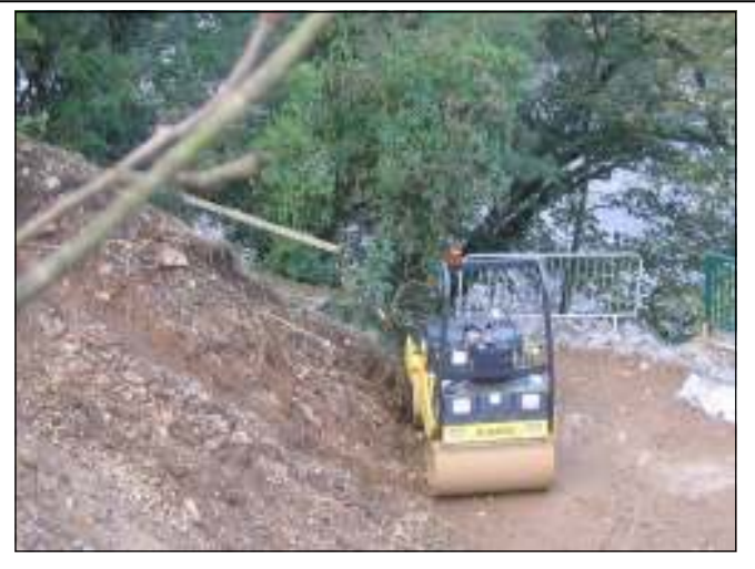
Looking down from the old road onto the new platform.