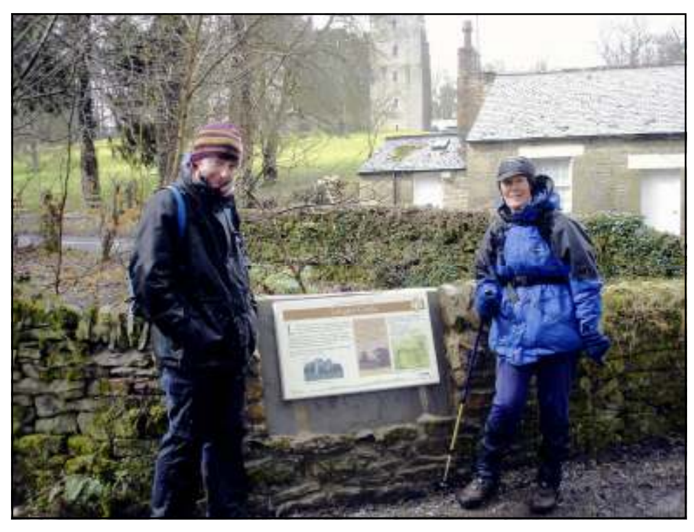
John Martin Heritage Trail