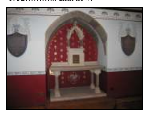
The newly restored chapel was opened with a ceremonial ribbon-cutting and is a unique feature in a unique hotel.

The Chapel has remained untouched since Josephine's death on 12th April 1932..... until now!