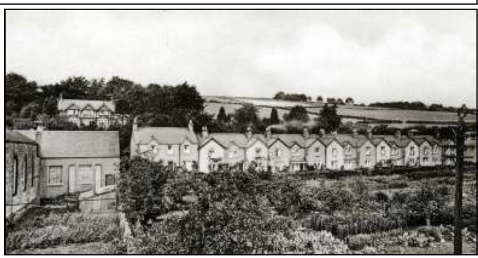
CALIFORNIA GARDENS Before the Fire Station was built in 1965 when 8 plots in gardens 1&2 were lost.

Mr. Coombes continues: 'A condition of this award gave householders in Haydon Bridge who had right of 'common', allotments as near as possible to the village. So in 1797, twenty two small allotments were provided alongside the Great North Road where it began at the end of the bridge loaning, (the junction between the present Church Street and Ratcliffe Road) on land which had formerly been the common pasture called Brigg Bank.'