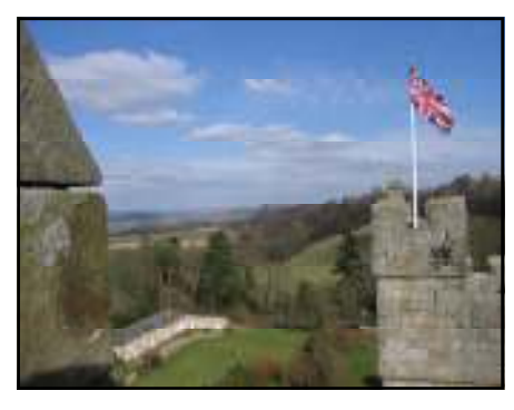
Who would want to live anywhere else?

The weather could not have been kinder for the celebrations at Langley Castle and the American visitors and locals alike took advantage of the clear blue skies, to marvel through the battlements at the views of our beautiful countryside.