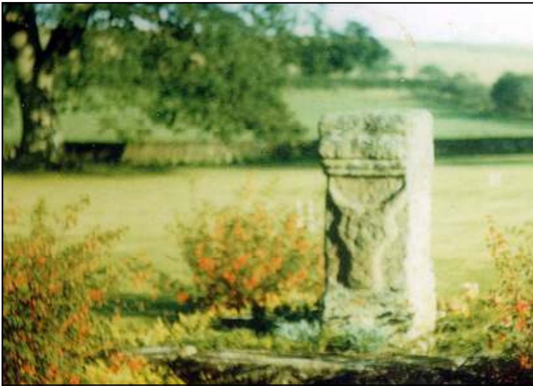
(see page 5)